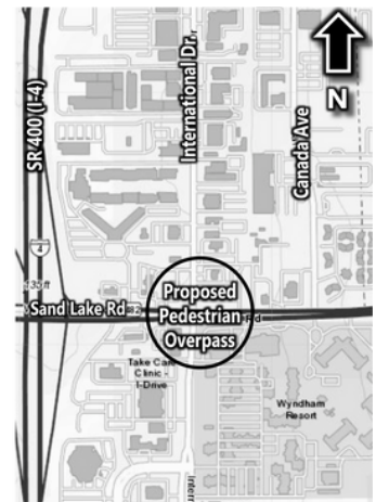
PEDESTRIAN BRIDGE LOCATION

The meeting will be on Wednesday, August 2, 2023, at the Embassy Suites, 8250 Jamaican Court, Orlando, FL 32819 . An open house will begin at 5:30 p.m. with a presentation at 6 p.m. Maps and displays of the project will be available for public review and comment. Members of the project team will be on site to answer questions.