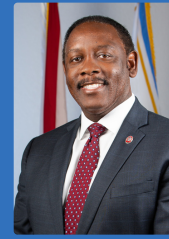
ORANGE COUNTY MAYOR JERRY L. DEMINGS